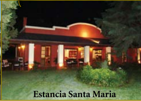
Estancia Santa Maria